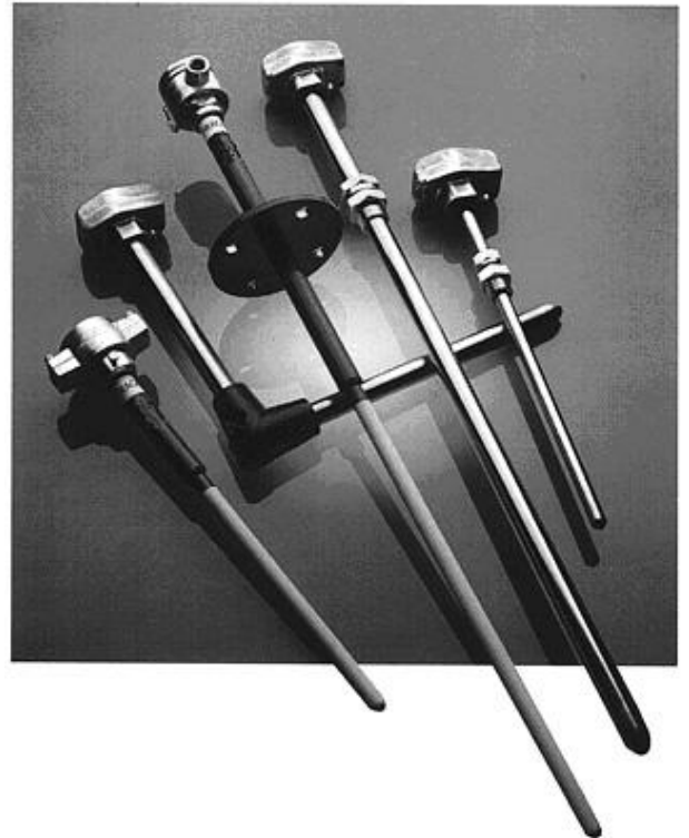
Typical Customised Thermocouples

Contact SK Environmental Sales Department with your requirements if our standard items are not suitable.